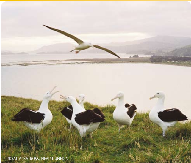
ROYAL ALBATROSS, NEAR DUNEDIN