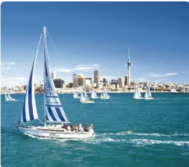
SAILING, WAITEMATA HARBOUR