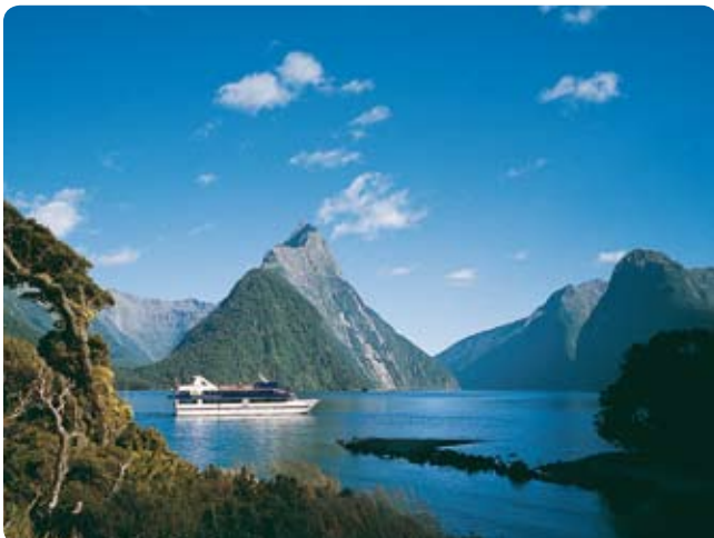
MITRE PEAK, MILFORD SOUND