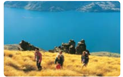
HIKING NEAR QUEENSTOWN