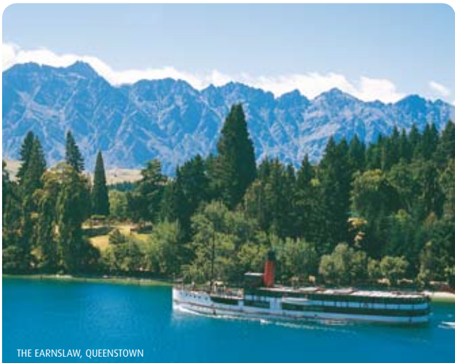
THE EARNSLAW, QUEENSTOWN