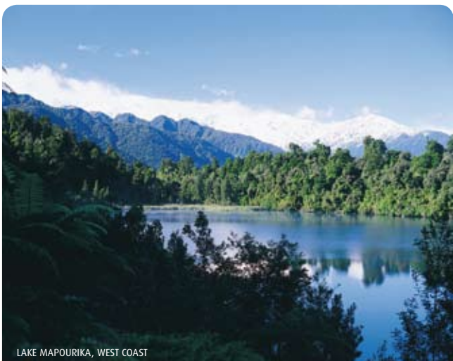
LAKE MAPOURIKA, WEST COAST