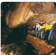
TE ANAU GLOWWORM CAVES