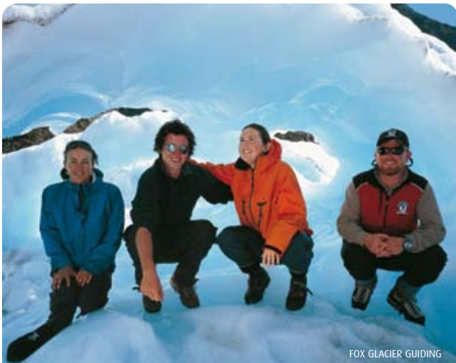
FOX GLACIER GUIDING