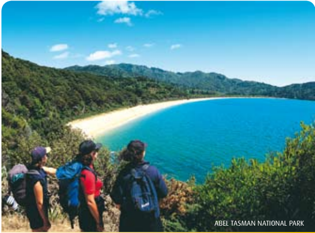
ABEL TASMAN NATIONAL PARK