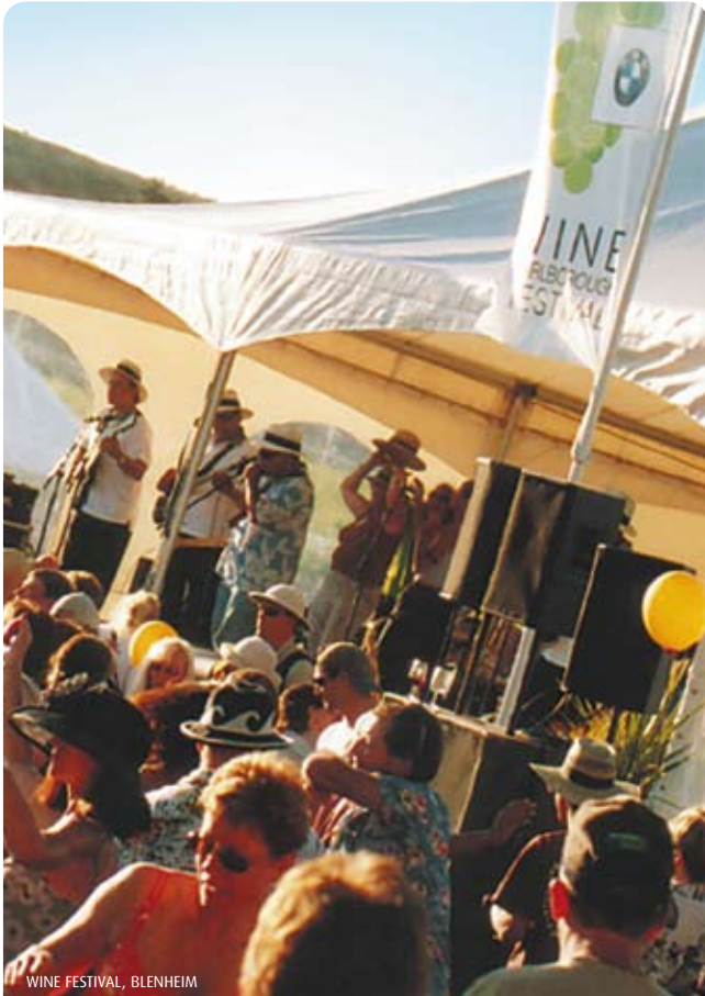
WINE FESTIVAL, BLENHEIM