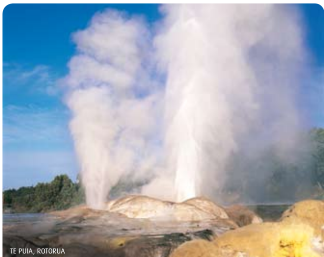
TE PUIA, ROTORUA