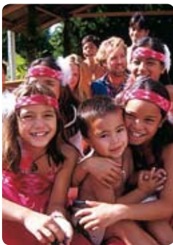
LOCAL CHILDREN, NORTHLAND