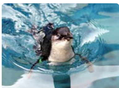
LITTLE BLUE PENGUIN, ANTARCTIC CENTRE, CHRISTCHURCH