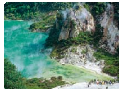
CATHEDRAL ROCK, WAIMANGU VOLCANIC VALLEY