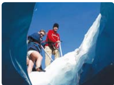
ICE CLIMBING, FRANZ JOSEF