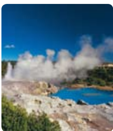
POHUTU GEYSER, TE PUIA