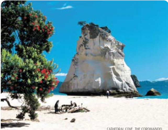
CATHEDRAL COVE, THE COROMANDEL