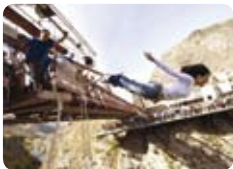
BUNGIE JUMPING, QUEENSTOWN