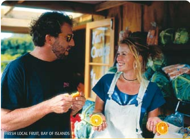
FRESH LOCAL FRUIT, BAY OF ISLANDS