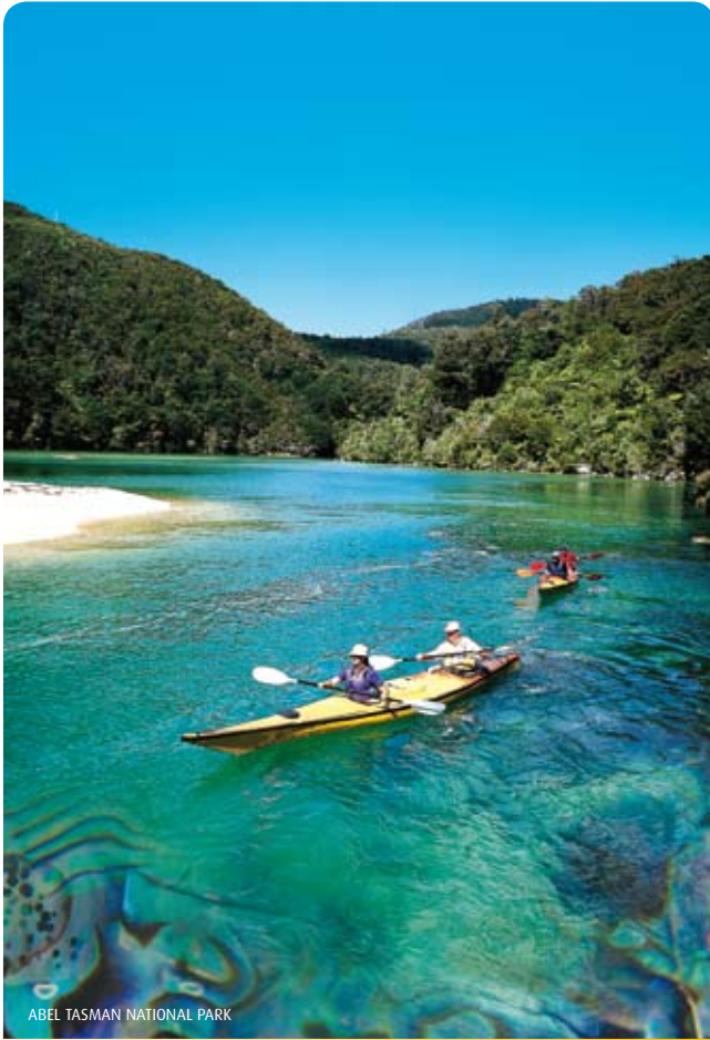
ABEL TASMAN NATIONAL PARK